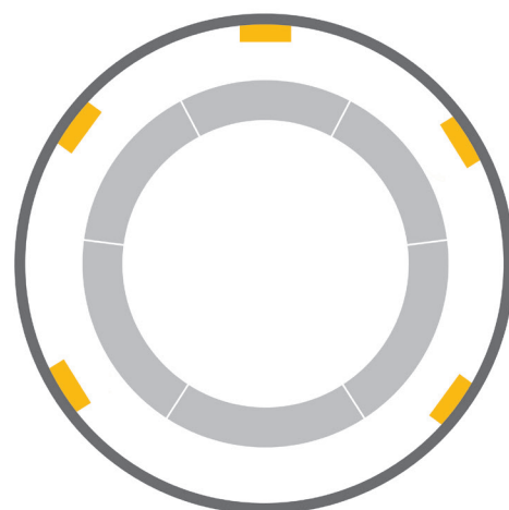
Tailskin Segment SLuM Sensor